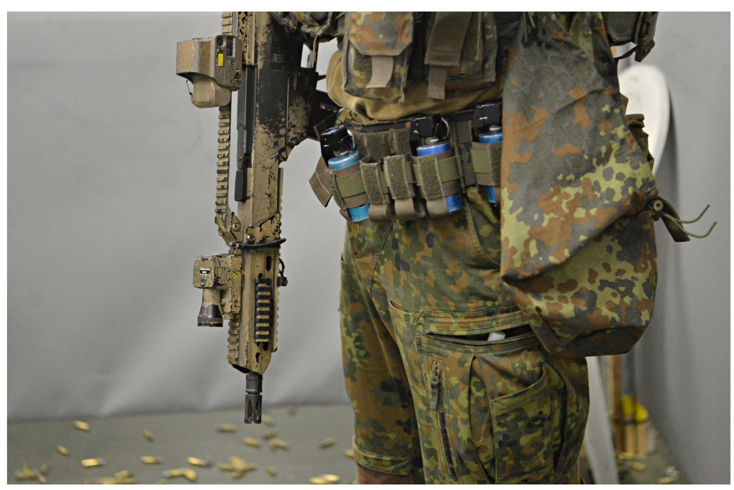
German Special Forces Command (KSK) soldiers train with G36 assault rifles on the unit's base in Calw, Germany, on January 23, 2017.